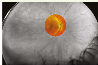
Fundus Camera View approx. 45°