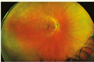
optomap Retinal Image 200°